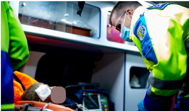
Prevention is the best treatment

Should a TBI-related accident occur on the jobsite, it is important for both employers and workers to know what steps to take, as immediate medical intervention could be life-saving for these types of injuries. Even TBIs that appear initially mild should be considered serious injuries, so it's important to call 9112 right away so the individual can be evaluated by a medical professional and receive treatment.